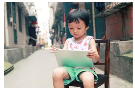
Relevant, affordable ICTs build skills for digital economies.

Vital Wave partners with foundations and other development organizations, technology and pharmaceutical companies, and governments to deliver transformative impact in developing countries.