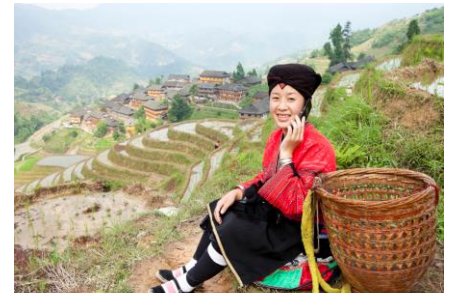
Digital payments saves time and improves the safety of workers.