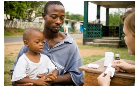
Strengthening data systems improves decision making and patient care.